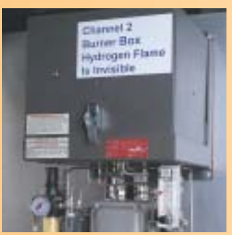
I & E Labeling